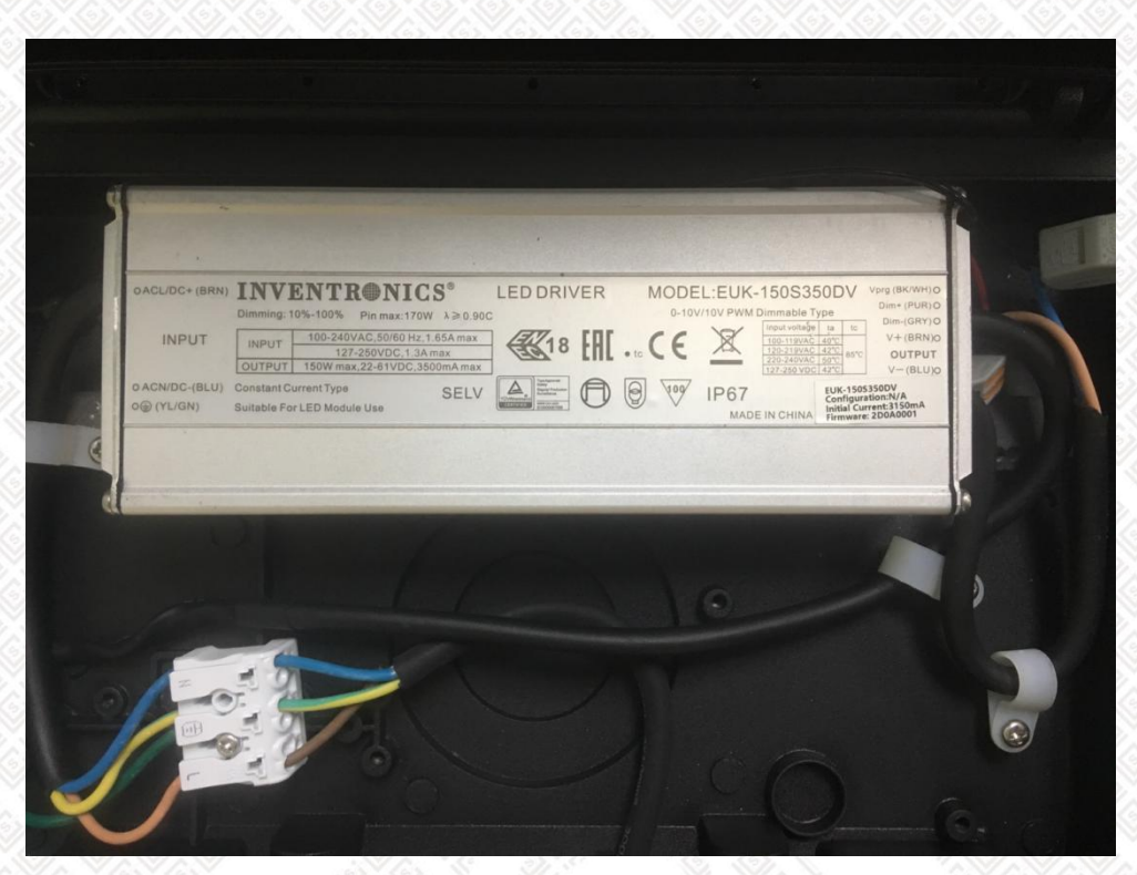
Figure 6 (Label of the LED driver)