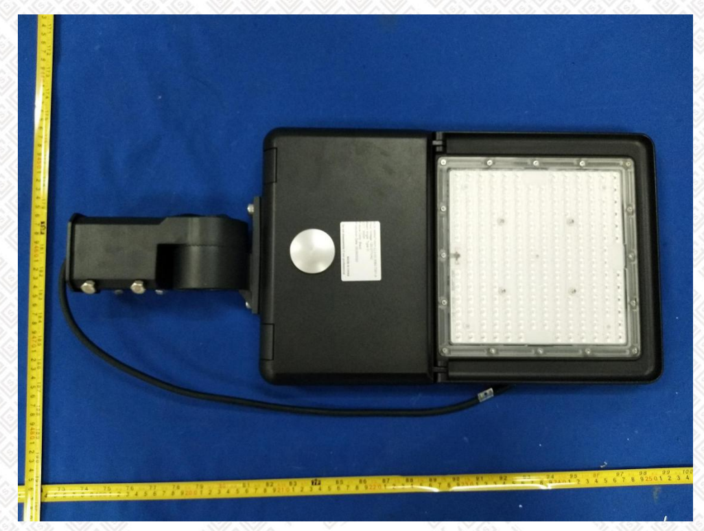
Figure 4 (General view)