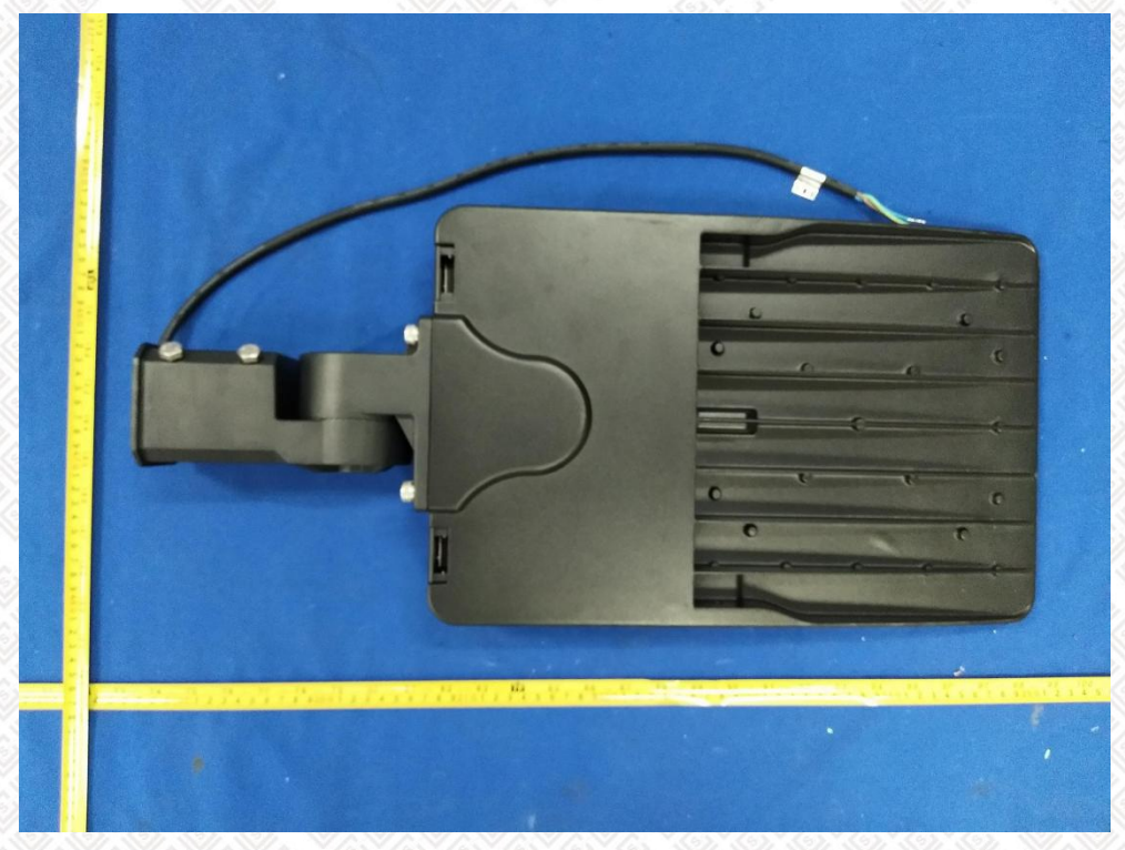
Figure 5 (General view)